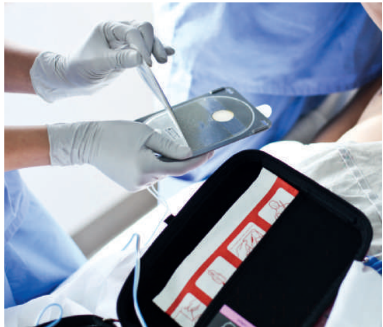
The HeartStart FR3 is small and light, which makes it easy to carry and maneuver in tight places.