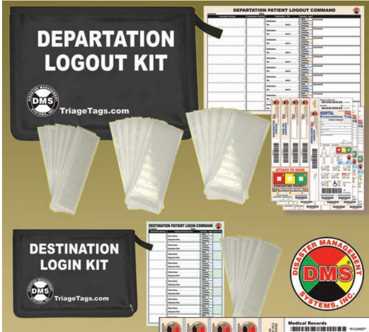
DMS-05719 Hospital Evacuation Kit

The DMS-05719 Hospital Evacuation Kit and the DMS-05721 Facility Evacuation Kit (for extended care and retirement residences) were designed to facilitate an efficient evacuation system through the use of door stickers utilizing colored check-box prioritization in consideration of patients' mobility. Patients with highest mobility would be categorized as first evacuees, Red, while patients with the least mobility would be categorized Green.