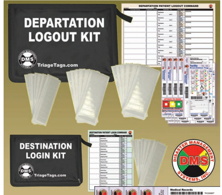
DMS-05721 Facility Evacuation Kit

The DMS-05719 Hospital Evacuation Kit includes 2 packs of DMS-05688 Hospital Evacuation Tags (25 tags per pack)